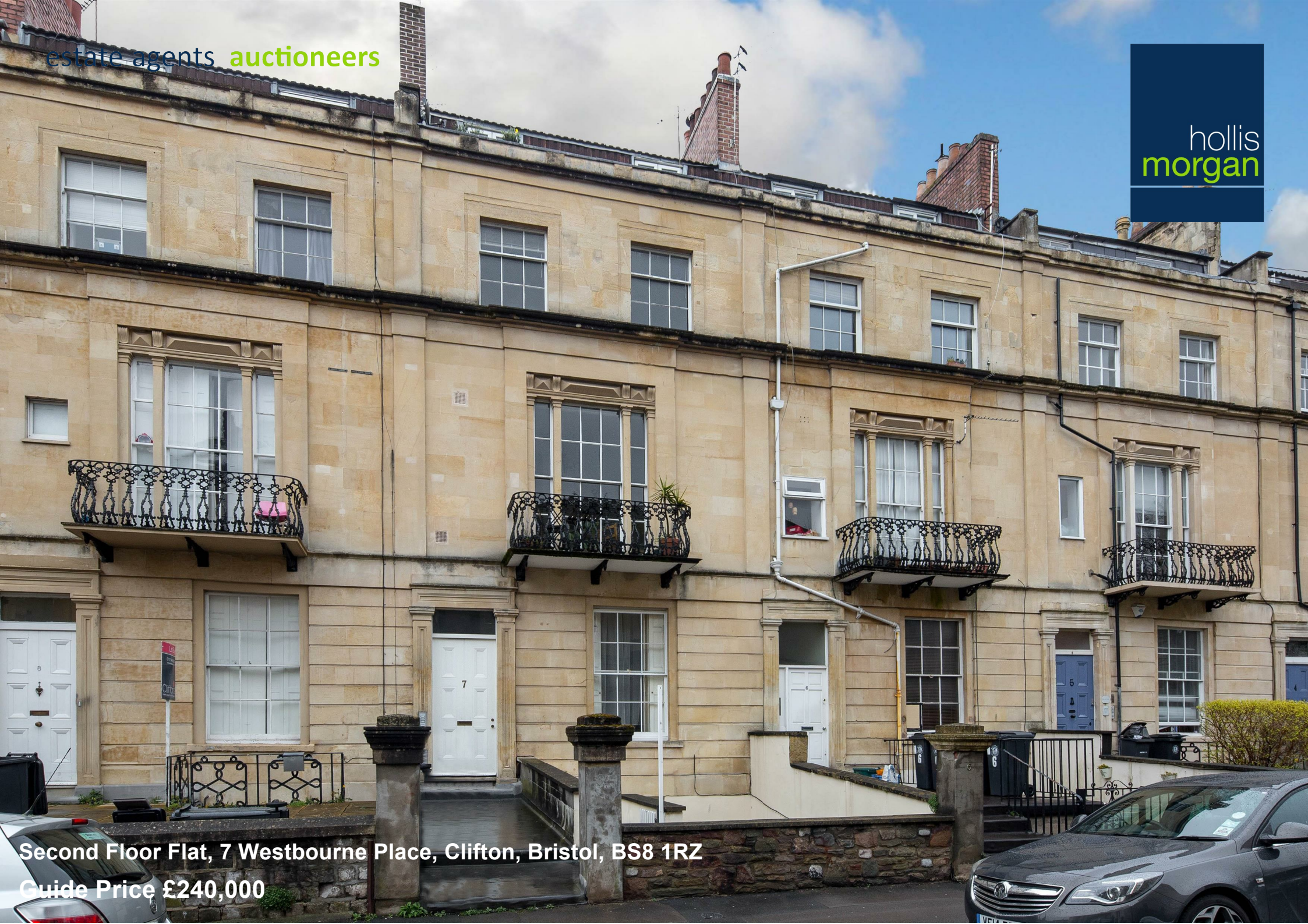
Second Floor Flat, 7 Westbourne Place, Clifton, Bristol, BS8 1RZ